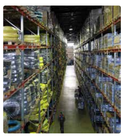
TO BE CONTINUED... WWW.HYDRAVIA.COM